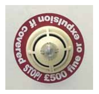
Smoke/heat detector in room